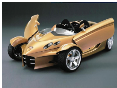
2009 Hyundai Cameron Concept

The team at Acme Cars want to make this a fun and enjoyable opportunity for you. In fact many of our customers drive in with their old car and out with their new - the same day!