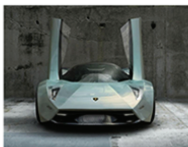
2009 Lamborghini Insecta