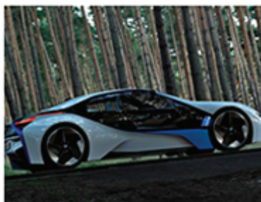
2012 BMW 740