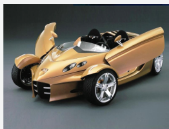
2009 Hyundai Cameron Concept

PS: We welcome any feedback you would like to give us about our service and your experience with Acme Cars. Please feel free to send through any suggestions or comments you have to sales@acmecars.co.nz .