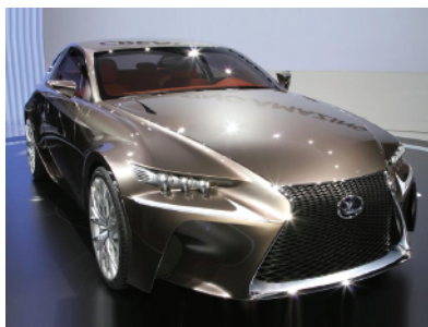
2012 Lexus LF Concept