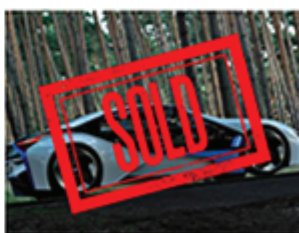
2012 BMW 740

Simply click on one to get more information, or if you prefer, feel free to pop in.