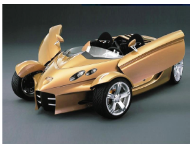
2009 Hyundai Cameron Concept

The team at Acme Cars want to make this a fun and enjoyable opportunity for you. In fact many of our customers drive in with their old car and out with their new - the same day!